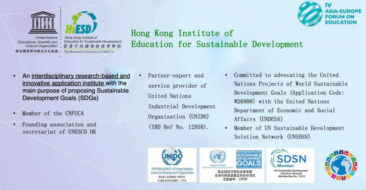
© 2021 Hong Kong Institute of Education for Sustainable Development. All Rights Reserved.

including accountants, engineers, teachers, bankers, property managers, tour guides, and people ranging from senior managers to graduate students, to college students have gathered to became "Certified Sustainable Development Planners (CSDP)" and initiated the establishment of "World Institute of Sustainable Development Planners" (WISDP)".